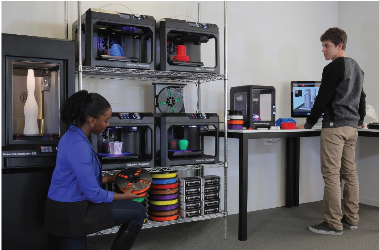
Texas State 3D Printer Laboratory

In terms of physical technologies, Alkek Library is in the midst of a multi-million dollar learning commons infrastructure expansion. A large offsite repository, the ARC (Archival Research Center) has been completed and Learning commons technology possibilities have entered design phases with various multi-phase learning commons centers. New technology areas being planned range from Visualization walls to Makerspaces. A 3D printing lab has been successfully launched in the past couple years year with a Youstar digital video studio for campus use and the 3D printing lab entering version two of expansion.