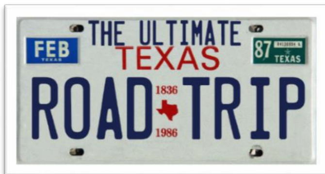
National Tour of Texas

Alkek Library Digital and Web Services is focused on technology, research and growth pursuing leading edge digital technologies and expanding possibility for online digital research and digital scholarship. Working in tandem with other library divisions, the unit in the past three years has completed three watershed years of technological innovation milestones and digital projects ranging from online exhibits and digital libraries to more technologically complex projects such as online research data repositories.